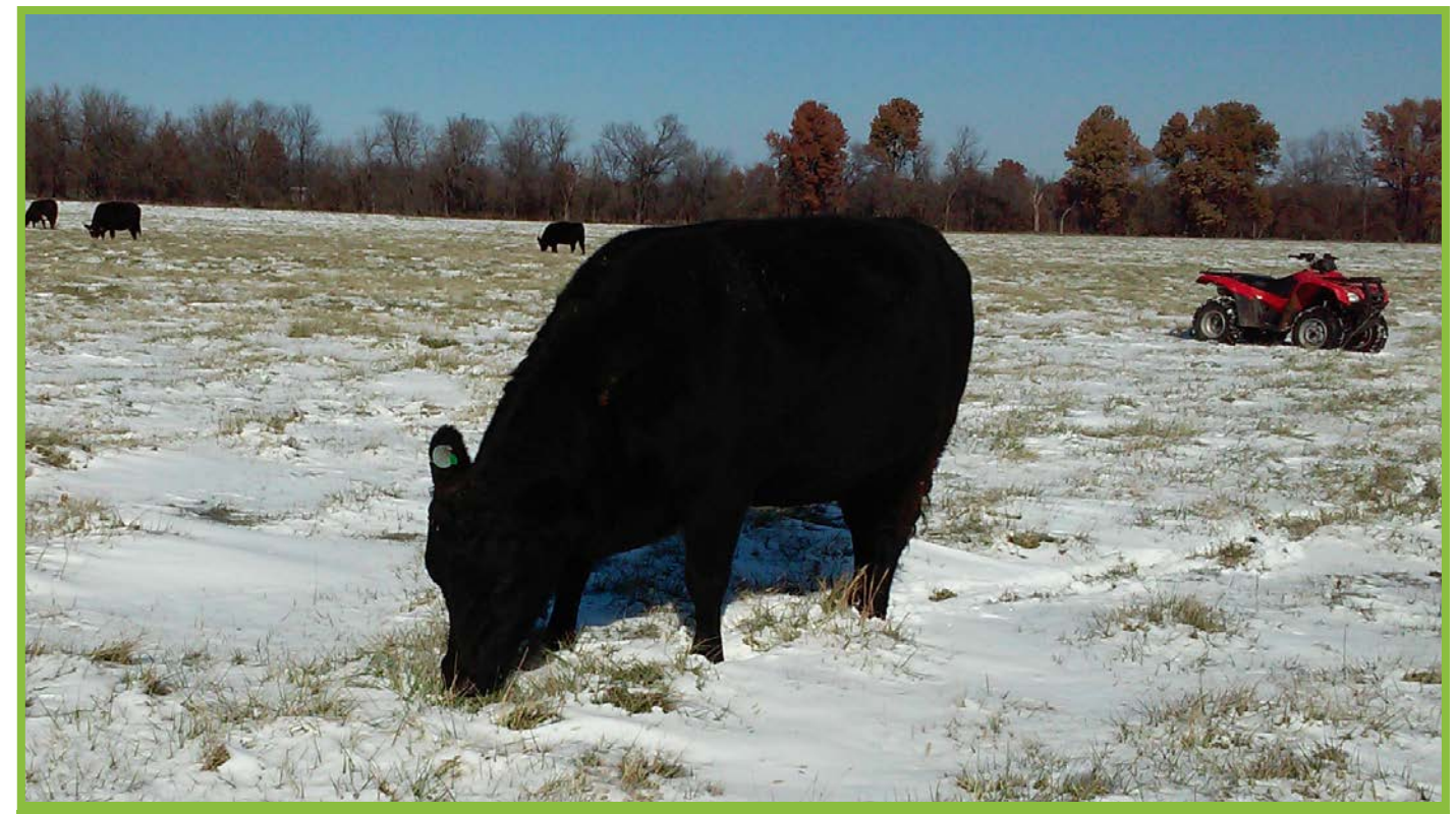
Stockpiling pastures properly allows for grass to extend above mild snows for cows to get the available forage needed that will hopefully save on feed and hay costs.