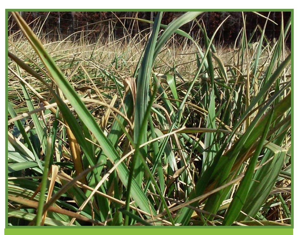
Proper fertilization and rotating cattle efficiently on stockpiled pastures will lead to forage being available for cattle during the winter.

Schnakenberg asserts that tall fescue by itself is enough. However, the added presence of clover is beneficial. The drawback of clover is that it will not last as long as fescue when winter approaches. Because tall fescue has a waxy cuticle, it can hold up well in cold weather; this is true