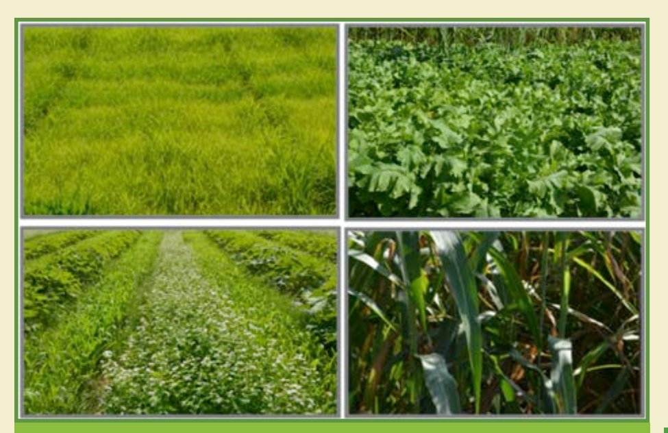
Top left: Pearl millet. Top right: Tillage® radish. Bottom left: Buckwheat and sorghum-Sudan grass intercropped with summer squash. Bottom right: Sorghum-Sudan grass

Weed Snuffers: Getting rid of weeds calls for a fast growing cover crop. It will quickly shade the soil and out-compete weeds. If a field is left fallow during the summer, a heat-loving grass, such as sorghum-Sudan grass or pearl millet, will choke out all but the toughest perennial (a plant with a life cycle of two or more years) weeds. The same crops can be seeded between plastic-covered raised beds. The cover crop should be mowed every so often to create a turf that feeds the soil while curbing weeds; it also creates a mud-free work area between rows. Sorghum-Sudan grass releases a chemical from its roots that acts like a pre-emergent herbicide; it prevents weeds from growing near it. A low-growing cover crop, such as buckwheat, can be used in the same manner along- (continued on page 7)