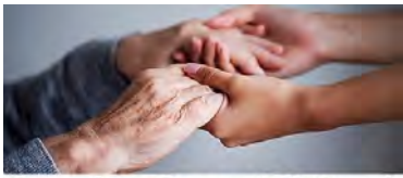
Caregiver Support Network